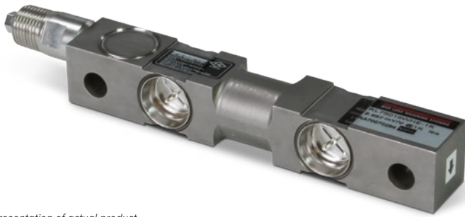
Picture is a representation of actual product.

Stainless Steel, Hermetically Sealed, IP69K